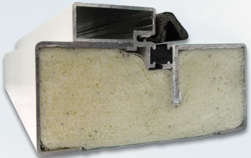
■ Optional Foam-Injected Insulated Frame