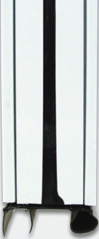
■ Durable Alcryn bulb & fin sweep